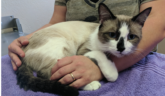
Cats with heartworms can develop serious disease and even die.

If even one or two heartworms survive to adulthood, a cat can develop serious disease and die. Signs include severe breathing distress, as well as blindness or seizures.