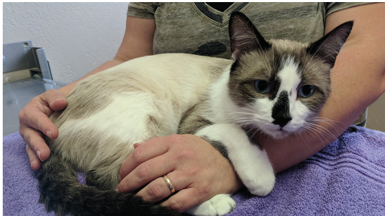
Cats with heartworms can develop serious disease and even die.

If even one or two heartworms survive to adulthood, a cat can develop serious disease and die. Signs include severe breathing distress, as well as blindness or seizures.