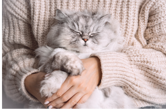
Keeping cats on year-round heartworm prevention is one of the best ways to show you love them.

Heartworm preventives for cats have the added benefit of also protecting cats from other common parasites.