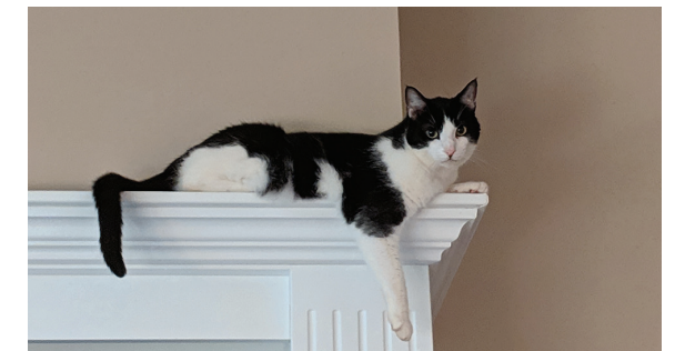
Because mosquitoes that carry heartworms can come inside, indoor cats are at risk for heartworms, too.

The best way to protect your pet against heartworms is to give the preventive year-round.