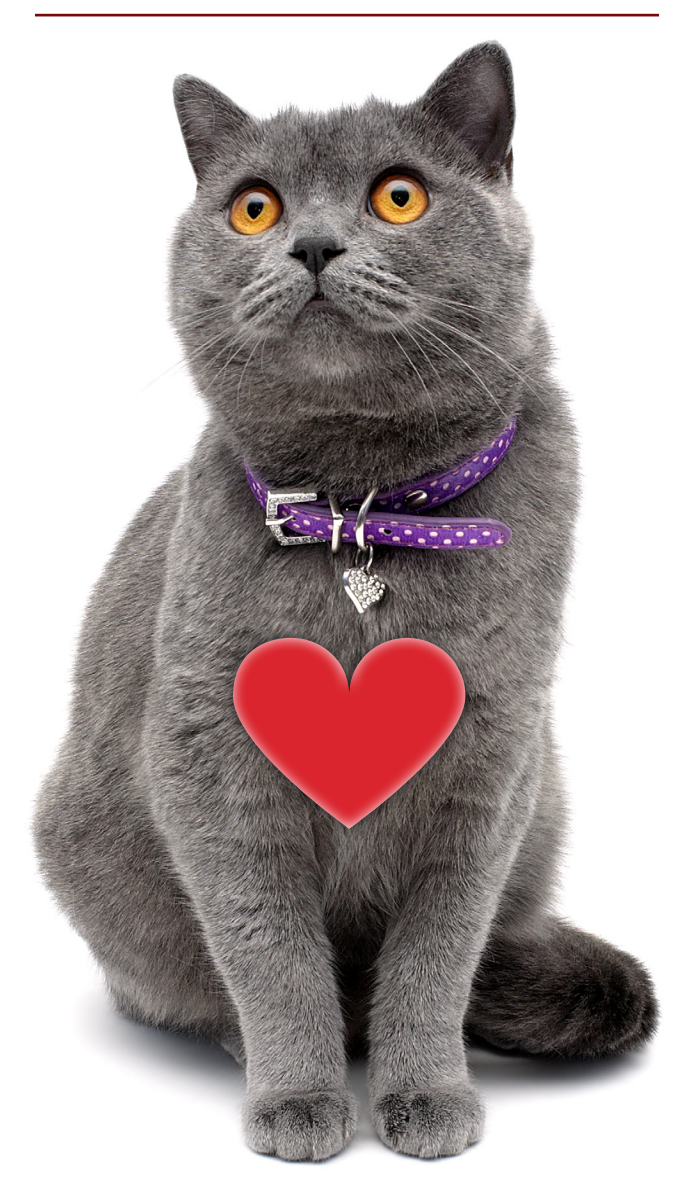
Keep Them Safe. Love Them Always.

Prepared by the American Heartworm Society and the Association of Shelter Veterinarians